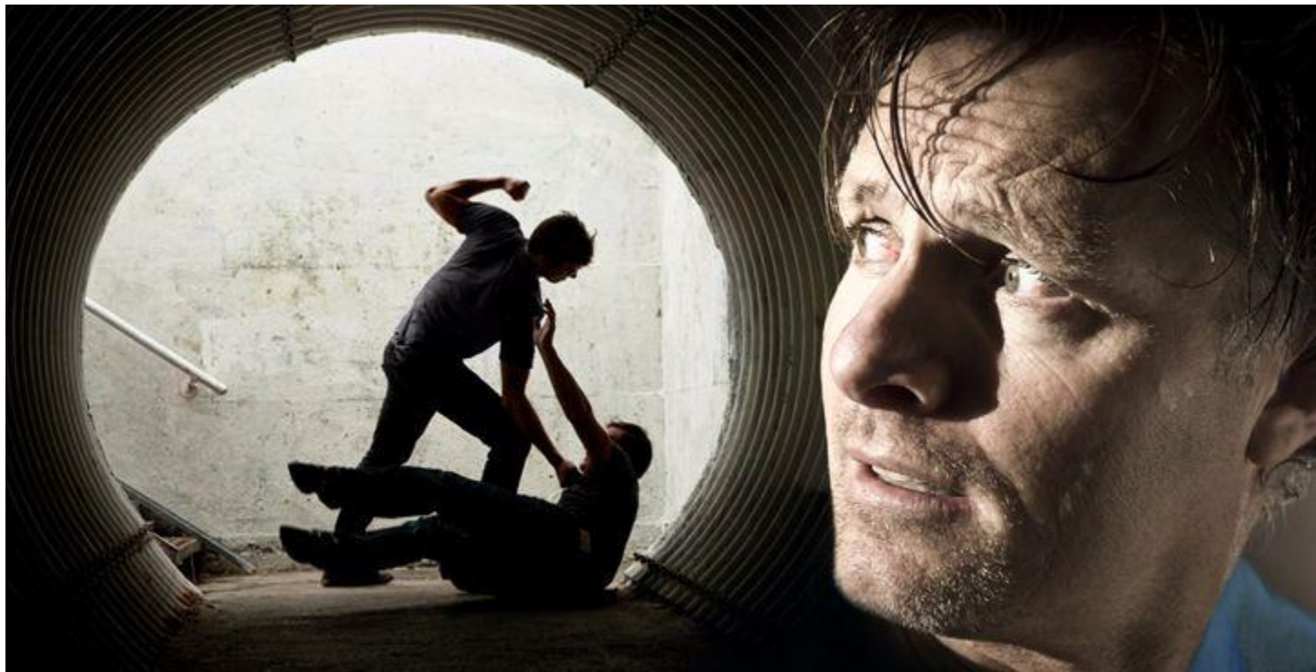
All who choose not to follow Christ will finally be destroyed with the sin they love

Answer: God will not destroy sin until everyone has been fully convinced of His justice, love, and mercy. All will finally realize that God, by asking for obedience, is not trying to force His will upon us, but rather is trying to keep us from hurting and destroying ourselves. The problem of sin is not settled until even the most cynical, hardened sinners are convinced of God’s love and confess that He is just. It will take, perhaps, a major catastrophe to convince some, but the horrible results of sinful living will finally convince all that God is just and right.