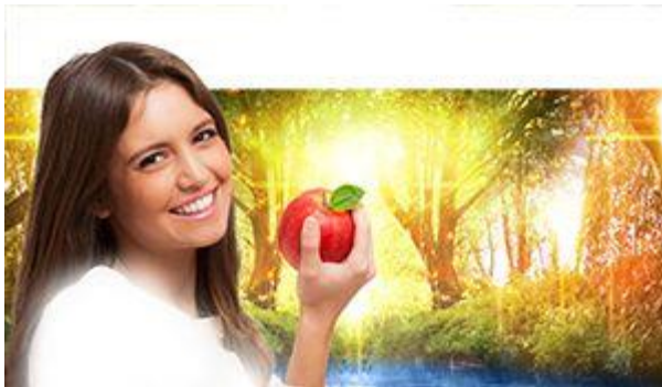
Heaven's fantastic tree of life brings unending life and youth to all who eat of it.

“The Holy City ... prepared as a bride beautifully dressed for her husband ... shone with the glory of God, and its brilliance was like that of a very precious jewel, like a jasper, clear as crystal. ... The city was laid out like a square, as long as it was wide” (Revelation 21:2, 11, 16 NIV). The city, with all of its precious stones, gold, and shimmering beauty, will be lighted with the glory of God. Its breathtaking majesty and purity is compared to “a bride beautifully dressed for her husband.”