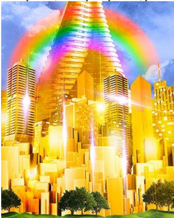
God is the architect and builder of the holy city.