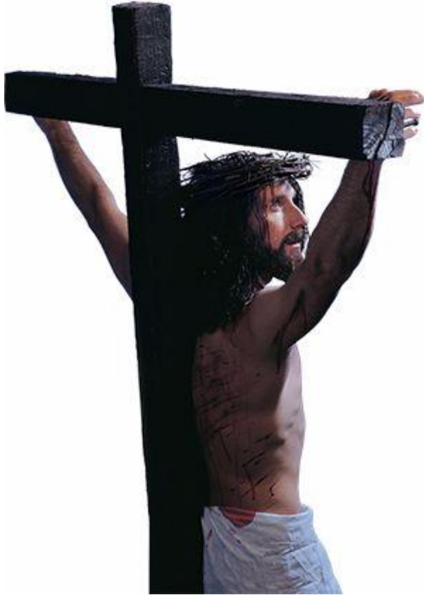
Jesus made the destruction of sin possible.