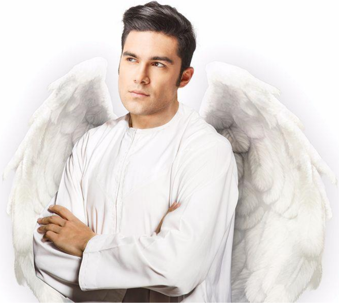
Lucifer was a heavenly angel created by God. He was perfect in wisdom and beauty and stood next to God's throne.